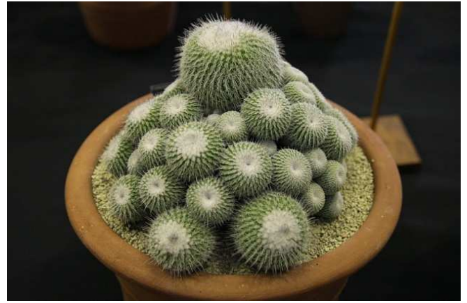
Epithelantha micromeris ssp. unguispina