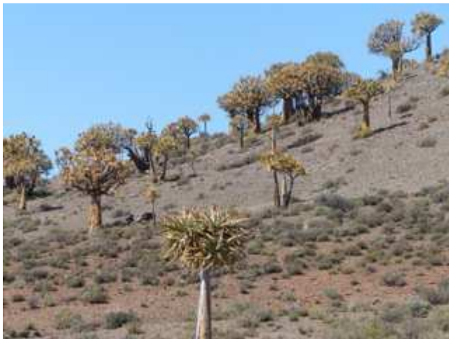
Quiver tree forest