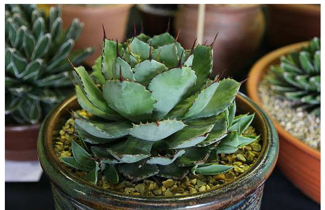
Agave potatorum 'Kichiokan'