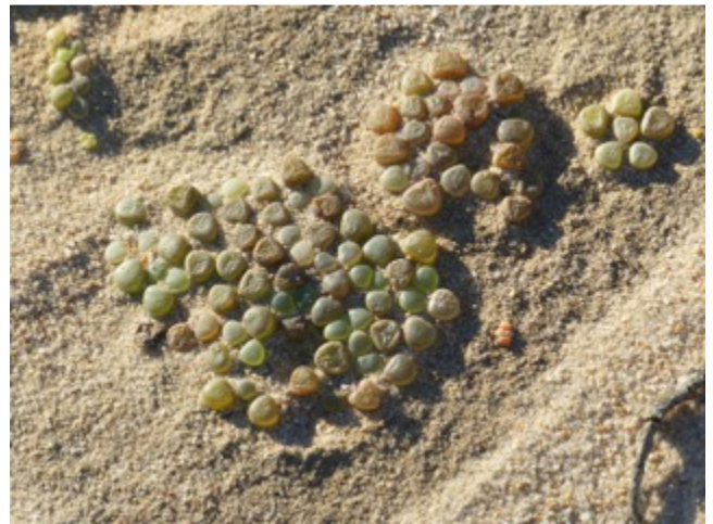
Fenestraria at McDougalls Bay